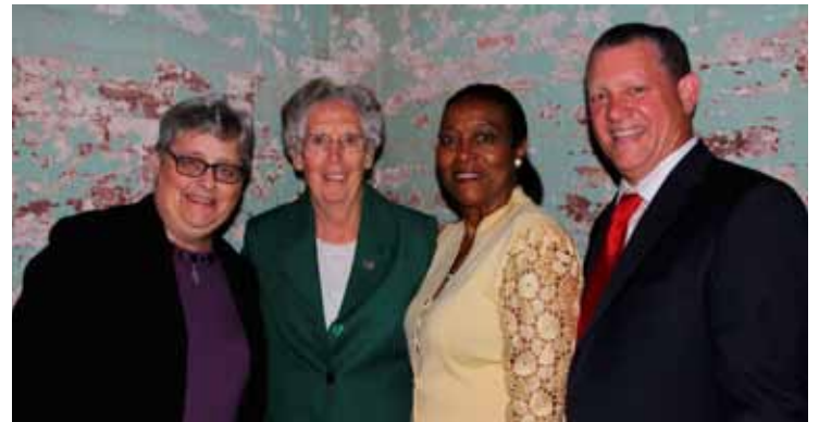
The Four Charleston Catholic School Principals

The Charleston Catholic School educates a socially diverse student body in a welcoming family environment within the sacred tradition and teachings of the Roman Catholic Church. Teachers challenge students through creative inquiry, critical thinking, and technology in academic subjects and the arts while developing self-discipline, compassion for others, and nurturing a strong Catholic faith.