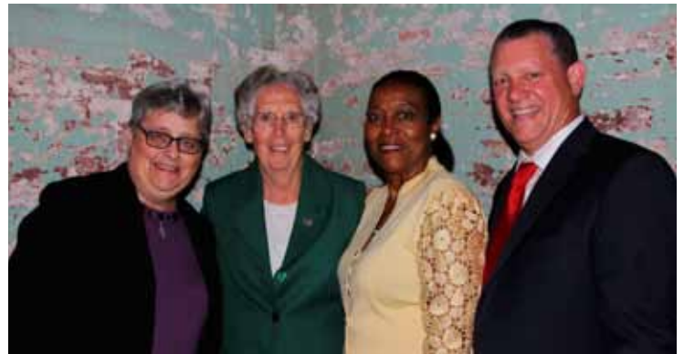
The Four Charleston Catholic School Principals

The Charleston Catholic School educates a socially diverse student body in a welcoming family environment within the sacred tradition and teachings of the Roman Catholic Church. Teachers challenge students through creative inquiry, critical thinking, and technology in academic subjects and the arts while developing self-discipline, compassion for others, and nurturing a strong Catholic faith.