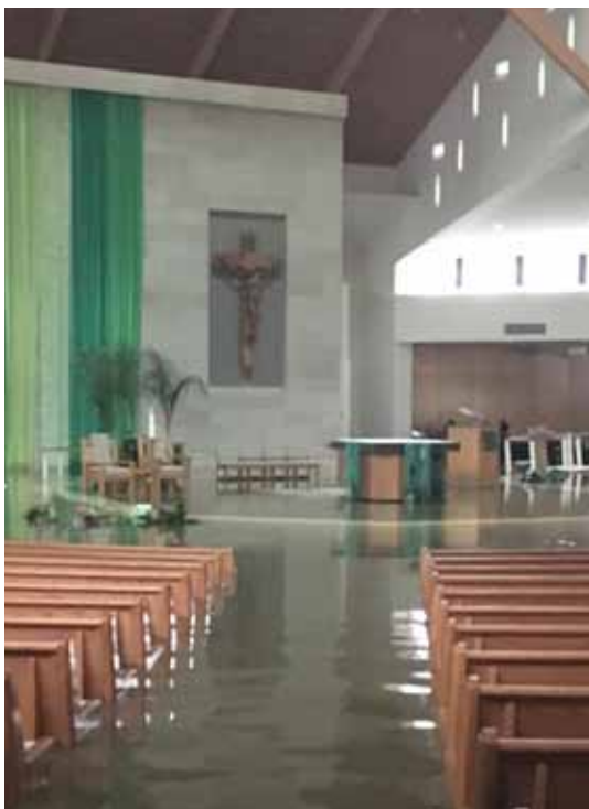
St. Ignatius of Loyola Catholic Church Sanctuary